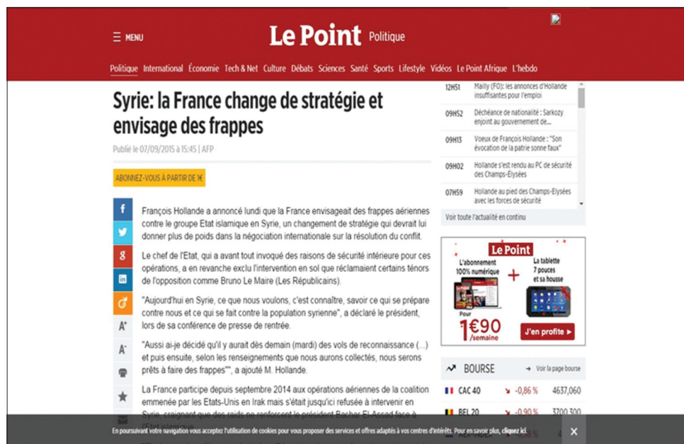
Figure 5. French magazine Le Point