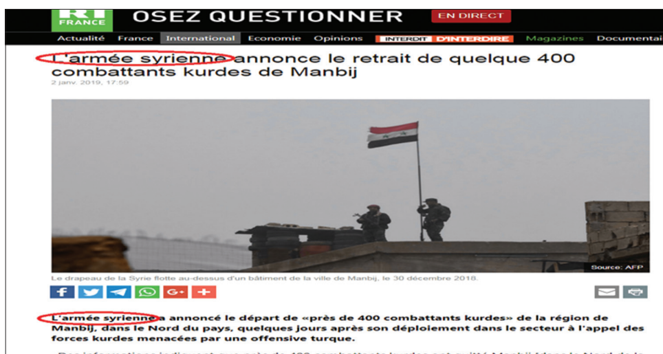
Figure 2. Russia Today agency, french version