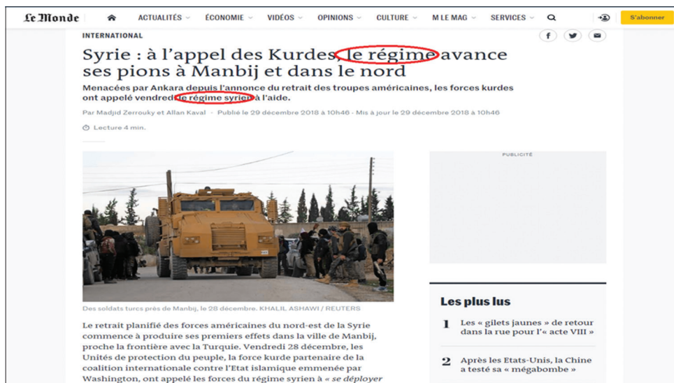
Figure 1. French news paper Le Monde

If we want to mention another example in this regard, we can talk about Western countries and most particularly France’s position to ISIL. In Iraq and Syria wars and with the advent of ISIL, from the beginning several Medias used the title of “Islamic State of Iraq and Al-Sham” was used, while the Western countries used the title “Islamic State”.