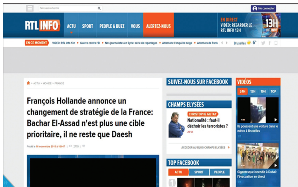
Figure 6. RTL media group

Le Point used the term “Etat islamique en Syrie” in September 2015 and on 16 November 2016, François Hollande used the term “Daesh”. This is exactly after the terrorist attacks in Paris. At the same time the Prime Minister, Wallace, used the same term which shows the change in the viewpoint and position of the country to this topic (Figure 6). As we can see here, French government changed its position and after terrorist attacks in his territory they consider Daesh as a terrorist group.