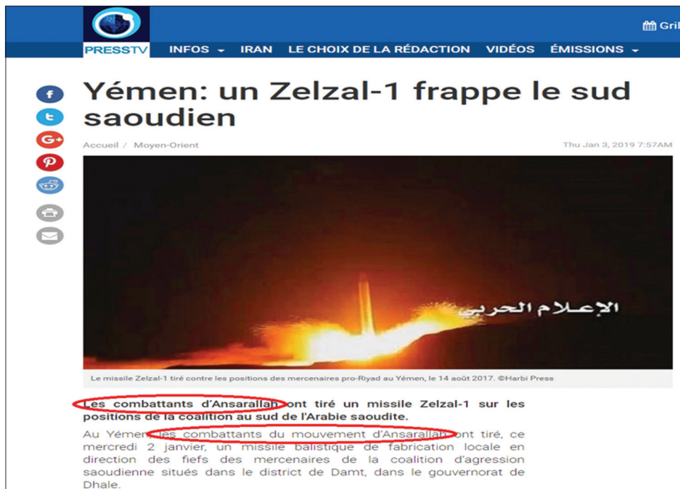
Figure 4. Iranian Press TV, french version

Using this phrase Western media only aimed at attributing the terrorist acts of this group to Islam and Muslims and to introduce Islam as a violent religion that theorizes such behaviors. Using this term was continued in France until the terrorists attacks happened in Paris. Since that time, with the