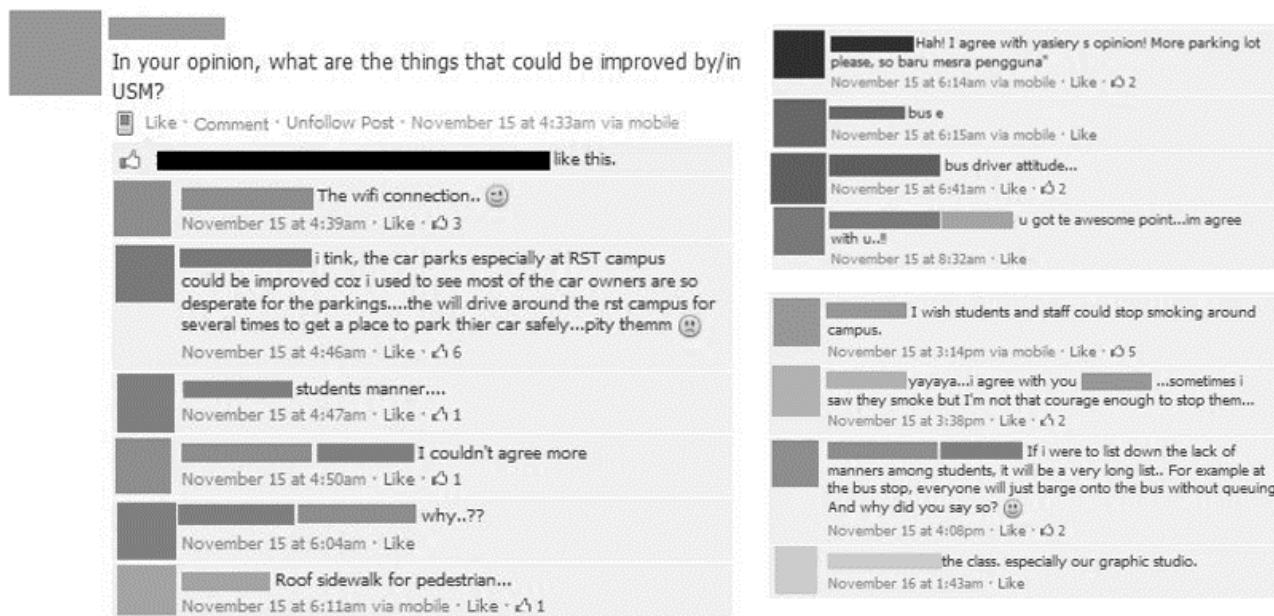
Figure 7. A university-related discussion in the group