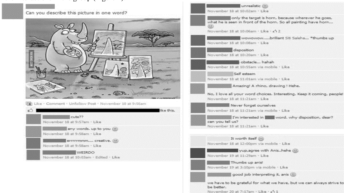
Figure 4. A post to enhance vocabulary acquisition

The interviewees saw the moderator as responsible in ensuring sufficient English language content and materials in the group. Previous findings similarly observed that students often feel demotivated to take charge of discussions, and refuse to let go of facilitators' control in the online environment (Clark, 2000). There were a variety of content shared by the moderator in the forms of reading articles, links to English language activities, grammar quizzes, discussion threads, audio recording, and comprehension exercises. For example, the moderator encouraged vocabulary learning from the interactions in the group (Figure 4).