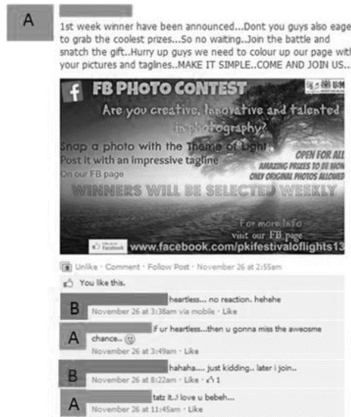
Figure 3. A socio-academic post that promotes a contest at the university

The findings show the different ways that the moderator and the members used the Facebook group. It was also observed that the students' motivation for using the group, shifted, from wanting to learn English language and socialising, to circulating information of the happenings at the university. Following previous literature, the students did not perform much academic activities in the group (Madge et al., 2009; Selwyn, 2009), but their active participation was skewed towards promoting university events. Perhaps, when their needs to learn English language were not met, they lost interest and found other ways to utilise the group.