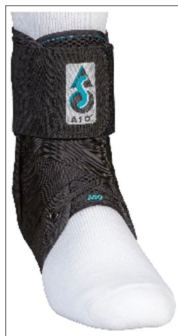
Figure 1. Semi-rigid ASO Ankle Stabilizer with Stays

The 15-m beep test fatigue protocol elicited fatigue in all participants while wearing the ASO ankle brace causing a significant increase in Borg scale results (pre-fatigue = 6.14 ± 0.53, post-fatigue = 15.93 ± 1.49) and lactate (pre-fatigue = 1.81 ± 0.97 mmol/L, post-fatigue = 10.65 ± 2.42 mmol/L). No brace condition showed similar results in Borg scale (pre-fatigue 6.14 ± 0.53, post-fatigue 16.29 ± 1.33), and lactate (pre-fatigue 2.04 ± 1.05, post-fatigue 10.44 ± 1.93). Furthermore, the VO_{2\max} results were not different between brace (41.75 ± 5.03) and no brace (41.75 ± 4.37). There was no significant interaction between brace and test and no significant main effect for test ( p > .05 ). However, on the ankle kinematics, results showed statistically significant effect on brace for initial contact plantarflexion (ICPF, F_{1,12} = 5.69, p = .034, \eta_p^2 = .32 ), peak ankle plantarflexion (PPF, F_{1,12} = 14.4, p = .003, \eta_p^2 = .55 ), and ankle sagittal displacement (ASD, F_{1,12} = 7.80, p = .016, \eta_p^2 = .39 ) during the cutting task (Table 1). The participants showed a smaller ICPF in brace (11.5°) compared to no brace (17.3°). Participants also showed a significantly smaller PPF in brace (28.2°) compared to no brace (38.6°), as well as ASD in brace (52.5°) and no brace (62.3°).