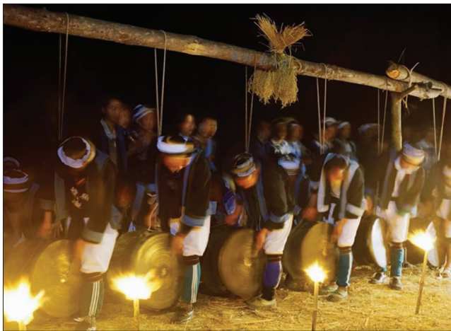
Figure 2. Bronze Drum performance in Nandan county

An evaluation of these efforts indicates that the government has made significant strides in raising awareness and supporting the visibility of this cultural heritage. However, while these actions have contributed to the preservation of ethnic minority musical instruments, challenges remain in ensuring the cultural authenticity of these practices, particularly as economic and tourism interests reshape traditional roles. Overall, the government's response has been impactful but requires continued attention to balance economic growth with the protection of northwest Guangxi's musical heritage.