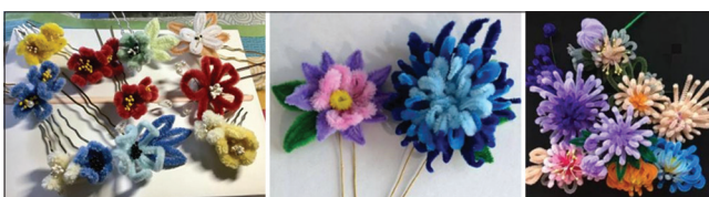
Figure 4. Students' works

In order to make the technique of the velvet flower get adequate protection and development, the Nanjing velvet flower