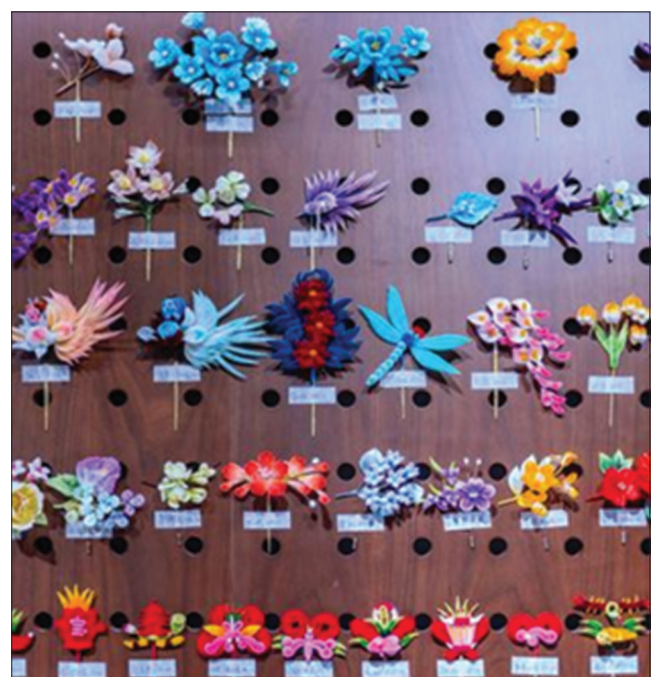
Figure 1. Nanjing Velvet Flower

In the course activities, students experience and practice four main steps: (i) Hooking, or “rolling.” According to the needs of the production of works, the different colors and