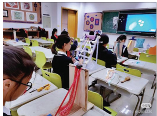
Figure 2. "Nanking Velvet Flower" aesthetic education program

The concept of quality education was first formally put forward in China in the late 1980s and early 1990s, mainly in