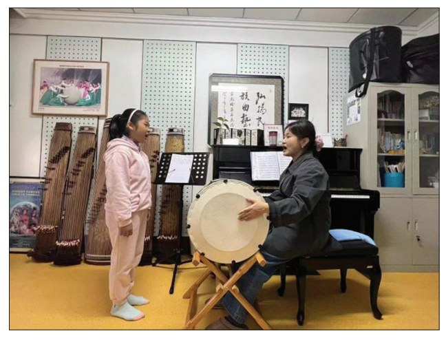
Figure 4. Transmission of the pansori practice to the young generation

Community-based initiatives that promote Pansori literacy through participatory activities, such as local festivals, workshops, and performance opportunities, can reinforce