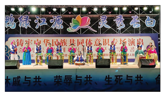
Figure 5. The special performance of pansori in the community