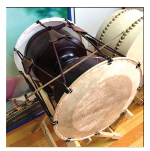
Figure 1. Pansori

Furthermore, the education of Pansori also involves teaching students about the modal scales and tonal systems unique to this genre. In "Shen Qing Song," a four-note scale