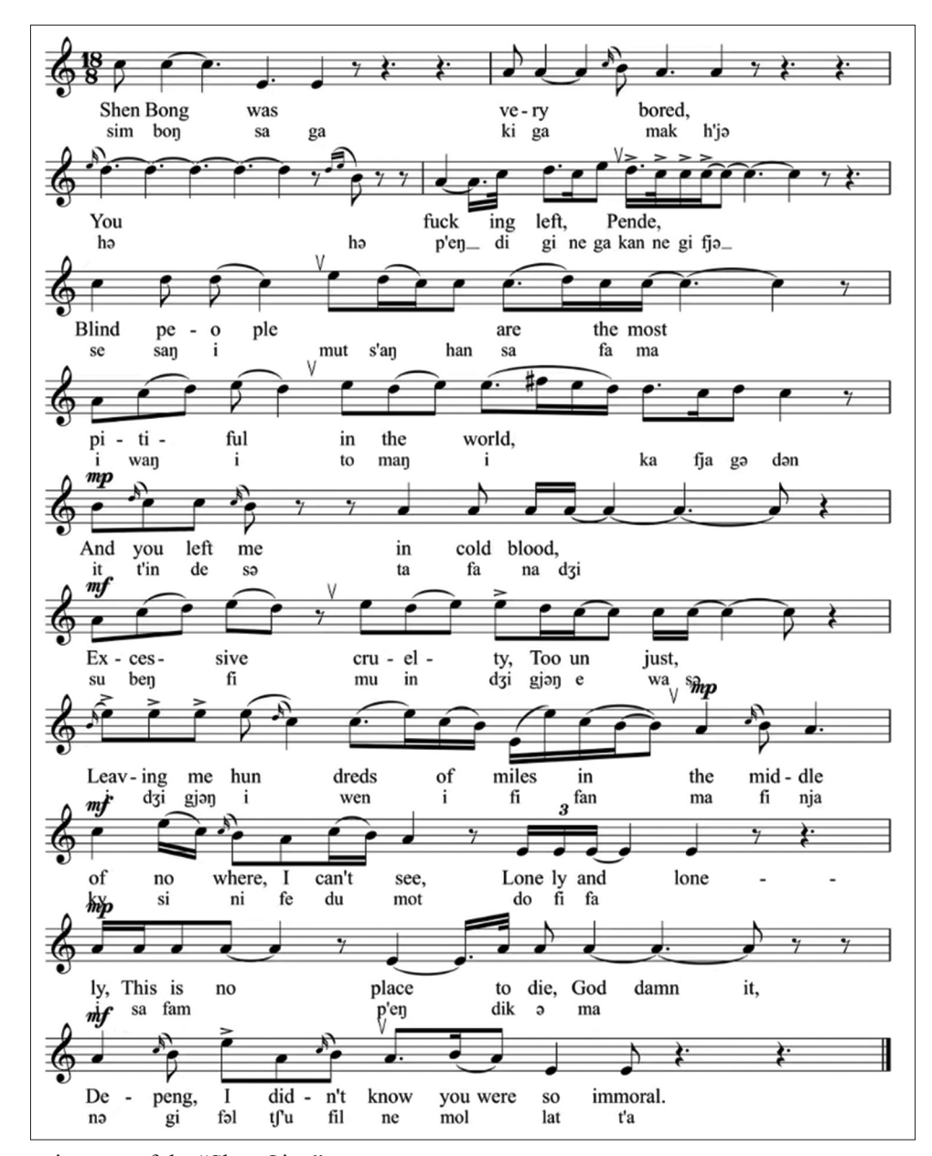
Figure 3. The music score of the "Shen Qing" song

a young student is engaged in learning Pansori under the guidance of an experienced instructor. The setting, replete with traditional instruments and cultural artifacts, reinforces the importance of cultural literacy in the learning process. The instructor in the image is seen teaching the musical notes and rhythms and immersing the student in the cultural environment inseparable from the art form. This method ensures that the students develop a holistic understanding of Pansori, seeing it not just as a musical genre but as a living tradition that encapsulates the values, history, and identity of the Chaoxian people.