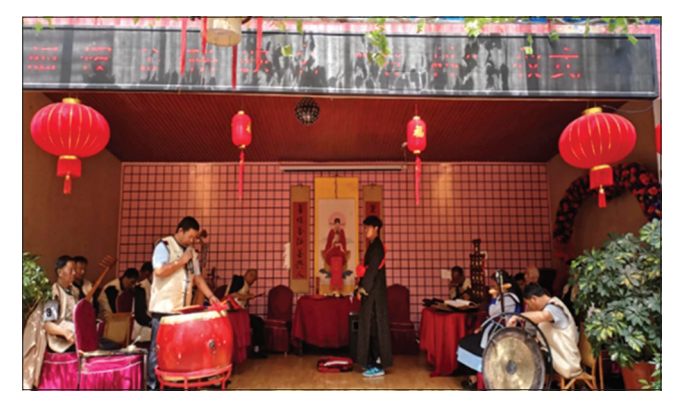
Figure 2. Dongjing Chinese folk music to celebrate the university admission ceremony