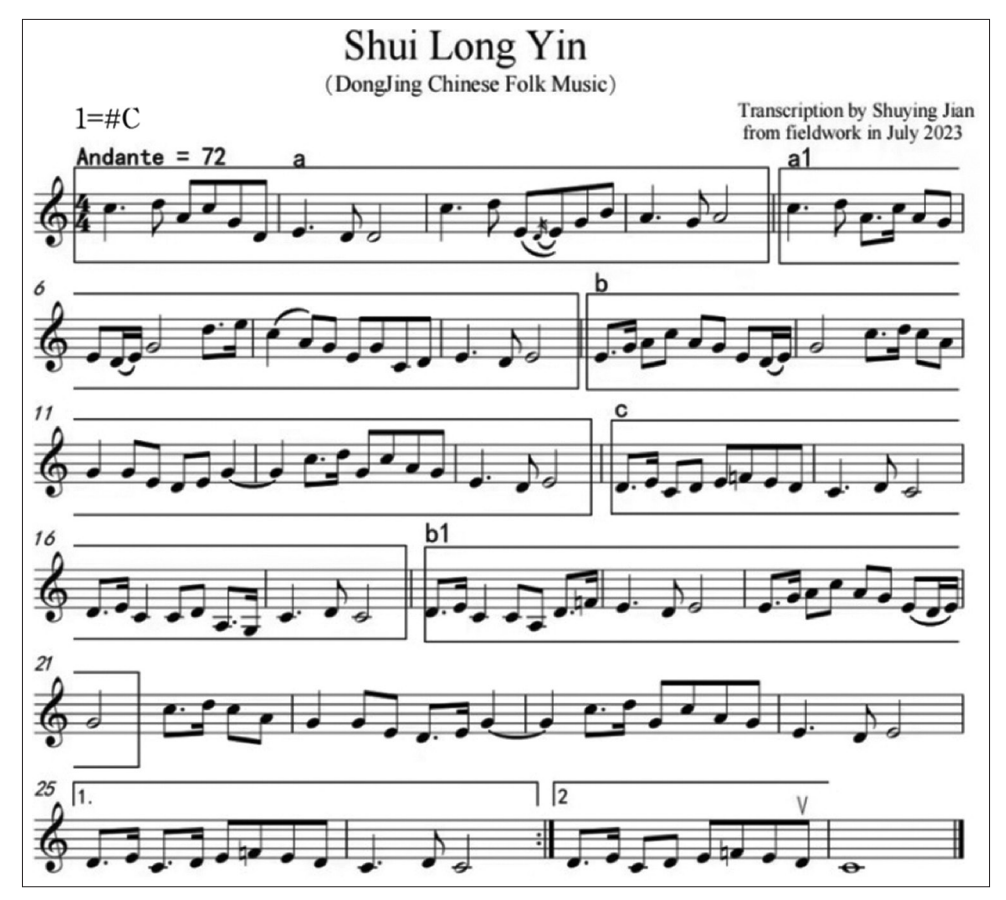
Figure 3. The music score "Shui Long Yin" of Dongjing Chinese folk music