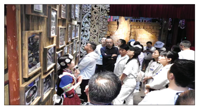
Figure 1. The social function of Dongjing Chinese folk music social event

Dongjing Chinese folk music has been effectively integrated into formal and informal educational settings in Lijiang City, Yunnan Province, serving as a vital tool for enhancing musical literacy and fostering a deeper understanding of traditional music among students and community members. The educational practices and pedagogical approaches surrounding Dongjing music are designed to ensure that learners not only acquire technical skills but also develop an appreciation for the cultural and historical significance of this traditional