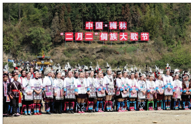
Figure 2. The sanjiang meilin dong grand songs festival in guangxi

The Dong Grand Song, a traditional Chinese singing instrument, faces numerous literacy, inheritance, and protection challenges. Economic development has led to migration