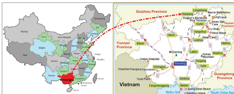
Figure 1. Map of research site

The findings focus on three primary components: the origins and history of the Dong Grand Song, the current state and challenges of its literacy and inheritance, and strategies for its development and preservation through educational initiatives. The findings are based on an extensive literature review, fieldwork, in-depth interviews, and participant observation.