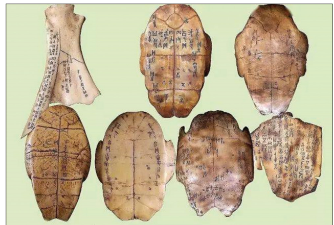
Figure 2. Oracle bone inscriptions of the shang and zhou dynasties

shells or animal bones, inherited from primitive human societies, was continued. These inscriptions mainly consisted of divination records of the late Shang royal court. They formed a complete and mature writing system known as the oracle bone script, the earliest known writing system.