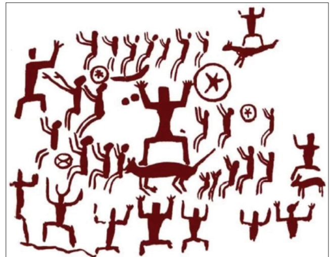
Figure 1. Patterns of the huashan rock paintings in chongzuo, guangxi

Before the invention of artificial ink, natural or semi-natural ink was commonly used as writing material. The Oracle Bone Inscriptions of the Shang and Zhou Dynasties (Figure 2) marked the beginning of Chinese calligraphy history. During this period, the tradition of carving on tortoise