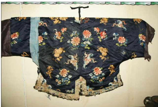
Figure 2. Qing Dynasty embroidered clothing from folk collections

of esteemed inheritors like Yang Huazhen are examined to understand how their efforts in innovation and dedication contribute to the broader market influence of traditional craftsmanship. Collaborative efforts with Yang Huazhen’s team will provide firsthand insights into the challenges and