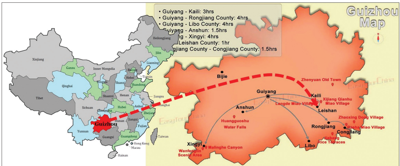
Figure 1. Map of research site