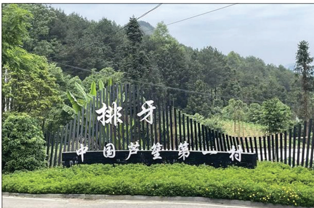
Figure 3. The construction of a Lusheng in Paiya village, Qiangdongnan, Guizhou Province

These strategic policies and community-driven initiatives, exemplified by the enterprising spirit of villages like Langde Miao, underscore the government's unwavering commitment to nurturing and preserving the cultural legacy of Lusheng. These initiatives not only bolster economic growth but also celebrate the profound cultural heritage embodied by the soulful melodies of Lusheng, ensuring that this cherished tradition continues to thrive and resonate across generations.