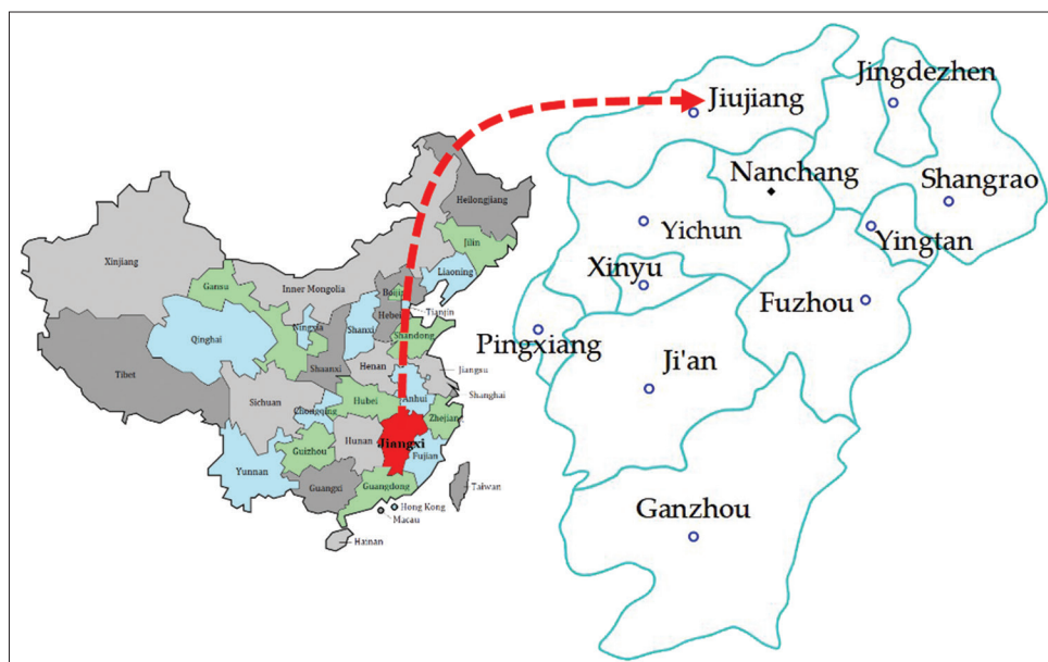
Figure 1. Map of research site in Jiujiang, Jiangxi Province

This study used qualitative methods to analyze Jiujiang folk songs in Jiangxi Province. Through live performances and structured interviews, themes, patterns, and trends were identified. Content analysis was used to identify recurring motifs and expert opinions on the state of Jiujiang folk songs, such as audience reactions and performance characteristics, was analyzed for significant correlations or trends. This comprehensive analysis provided a holistic understanding of the cultural, artistic, and educational dimensions of Jiujiang folk songs, aiding in the formulation of sustainable preservation and transmission strategies.