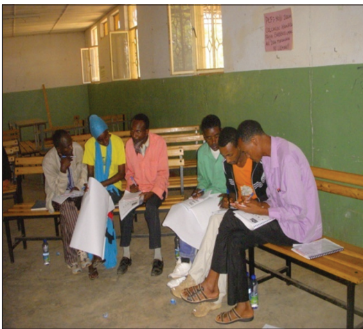
Figure 1. Group work (Yabello)

During the whole-group discussions, the teacher-trainees presented what they had discussed in groups through their group leaders/secretaries as seen in Figure 2. After each group's presentation, whole-group discussions were conducted according to the following procedures focusing on feedback comments. First, the teacher-trainees were encouraged to give their own comments and suggestions on the presentations of each group's work. Then, the trainer and the IIRR technical experts gave feedback comments on the presentation of each group and on the comments/suggestions given by other teacher-trainees for possible reconsiderations/revisions. This enabled each group to realize its strengths (what it did well), its gaps (areas that needed improvements) and ways of doing it better. Finally, each group revised its group work incorporating the feedback comments/suggestions received and included in its portfolio for using them in teaching early reading skills in schools.