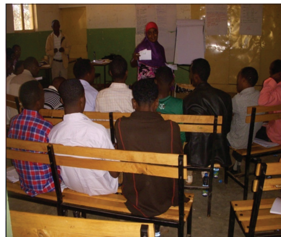
Figure 4. Peer-teaching session (Yabello)