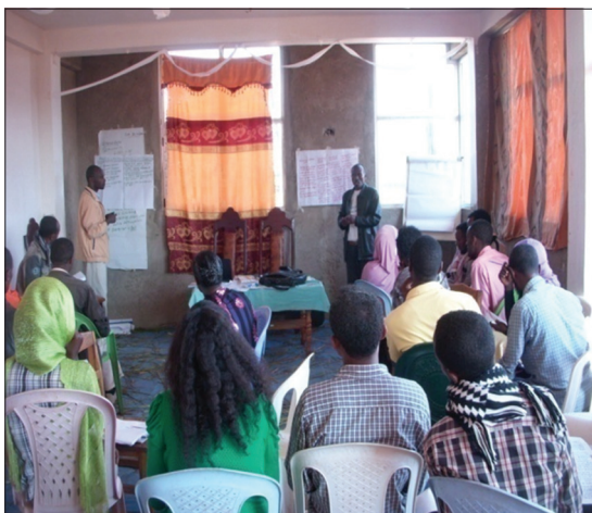
Figure 2. Presentation of group work (Adolla)