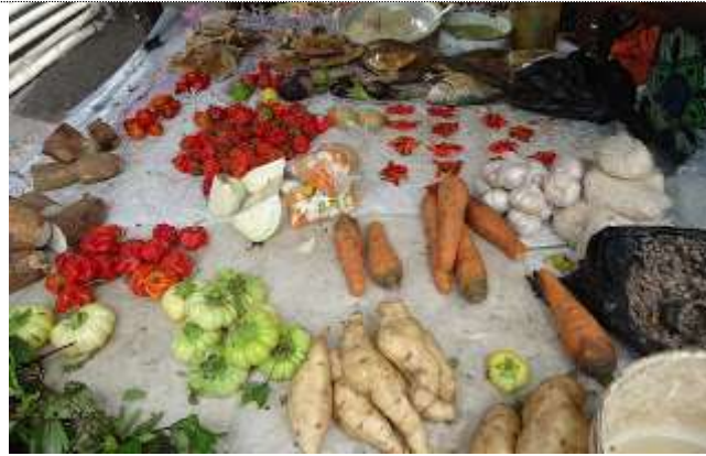
Figure 1. Archetypical market offerings and inventory of women in urban Gambia, from the researcher's collections

Starin (2009) was observing economic activity in rural Gambia, but arguably, both urban and rural women petty traders suffer from the lack of capital that limits women to small-scale trading activities. The study participants were engaged in a wide variety of petty trading activities in the market and their neighborhoods. That spectrum is summarized in Table 1.